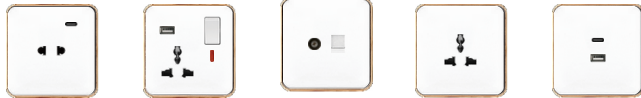
2 pin socket 1 gang 3 pin MF socket+USB+Type C TV+TEL socket TV+computer socket 3 pin MF socket USB+Type C