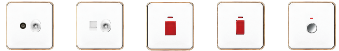
Satellite+TV socket Satellite+TEL socket Satellite+computer socket 45A DP switch 25A DP switch Touch switch