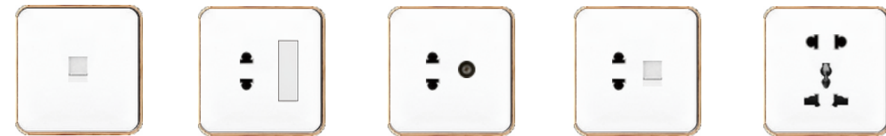
TEL socket Computer socket 1 gang with 2 pins socket 2 pin socket with TV 2 pin socket with TEL 2 pin socket with Int 5 pin MF socket