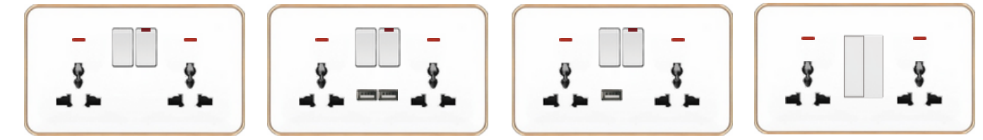
2 gang 3 pin MF socket with neon 2 gang 3 pin MF socket with neon+2USB 2 gang 3 pin MF socket+USB+Type C with neon