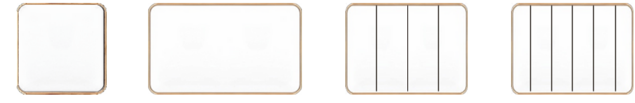
Blank plate Blank plate(3*6) Big panel 4gang Big panel 6gang 2 gang 3 pin MF socket