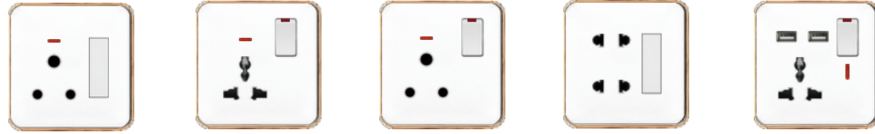
1gang 15A 1 gang 3 pin MF socket with neon 1 gang 15A socket with neon 1 gang with 4 pins socket 1 gang 3 pin MF socket with neon+2USB