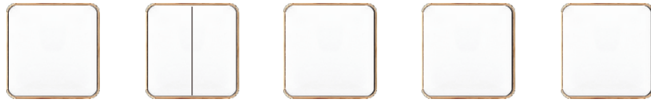
1 gang 1 way switch 1 gang 2 way switch 2 gang 1 way switch 2 gang 2 way switch 3 gang 1 way switch 3 gang 2 way switch 4 gang 1 way switch 4 gang 2 way switch Doorbell switch

LIGHT SWITCHES A NEW WAY TO EXPERIENCE DESIGN AND FUNCTION