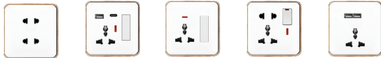
4 pins socket 1 gang 13A socket with neon+USB+Type C 1 gang 3 pin MF socket 1 gang 5 pin MF socket with neon 3 pin MF socket+2USB+Type C