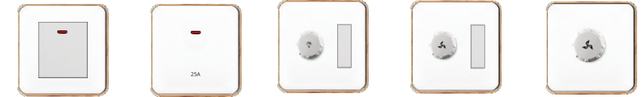
25A DP switch 45A DP switch 25A DP switch 45A DP switch 1gang + dimmer 1 gang+Adjust speed Adjust speed